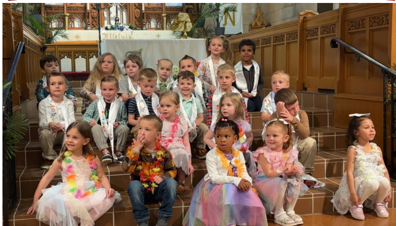
Noah's Ark students during their end of year program which took place on May 22.