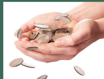
First weekend of the Month!

NOISY OFFERING is received the first weekend of each month. The next collection will be March 1 & 2, 2025. This collection will be given to the LIFT Let’s Build Beds