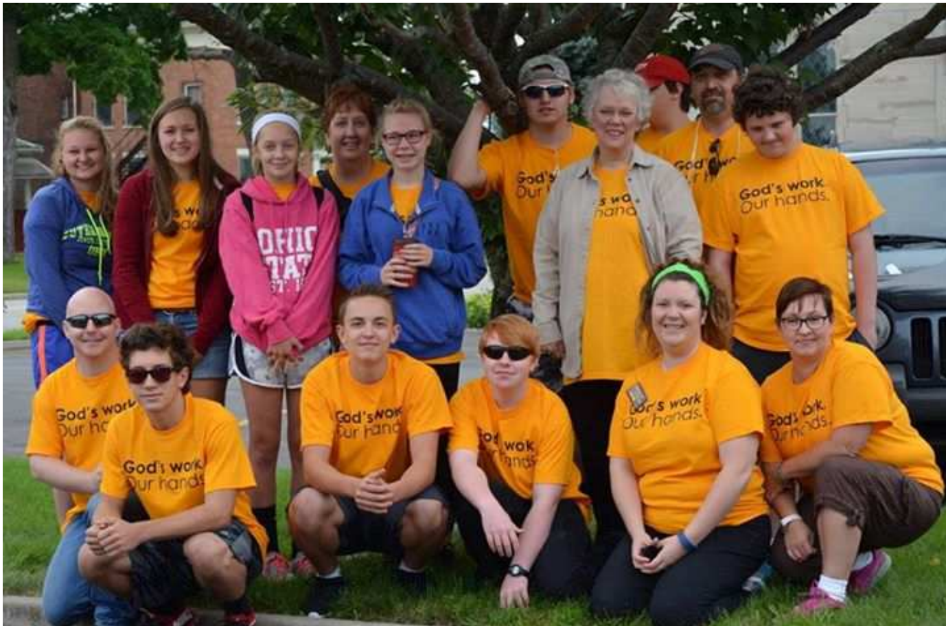
Youth and leaders as they prepare to leave for the National Youth Gathering in Detroit, July 15-19.

... AND AWAY THEY GO! This group of youth and leaders from Grace and St. John's joined forces with over 30,000 youth from all over the United States at the National Youth Gathering! We will look forward to hearing about their adventure!